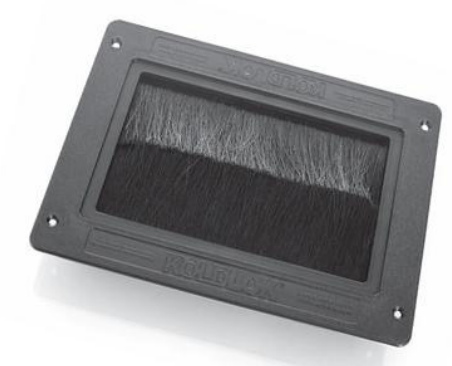
Integral - Part No. 1010