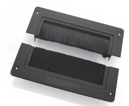
Split Integral - Part No. 3030