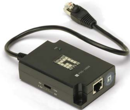
PoE Splitter: Weight 150g, 80 x 55 x 26 mm. Separates power and data into ethernet cable and barrel plug. Set the switch on the side to 12V to power your climate monitors.