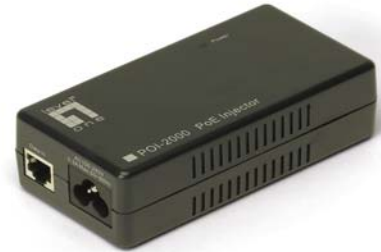
PoE Injector: Weight 200g, 117 x 60 x 35mm. Combines 120VAC with data. Output is CAT5 cable up to 300'. Power cord included.

The specified maximum length of cable allowed between the injector and splitter should be 100 meters or approximately 300 feet. The signal will start to degrade past this length.