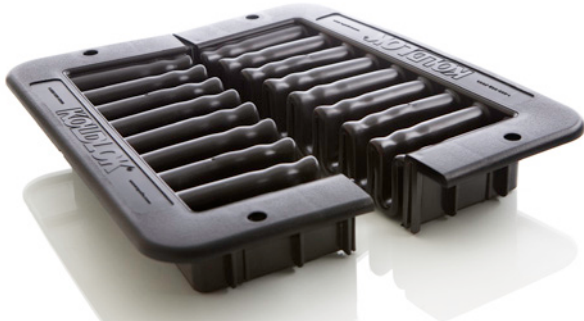
Wave Raised Floor Grommet Part No. 20100