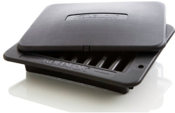
Wave Grommet Cover Part No. 20101