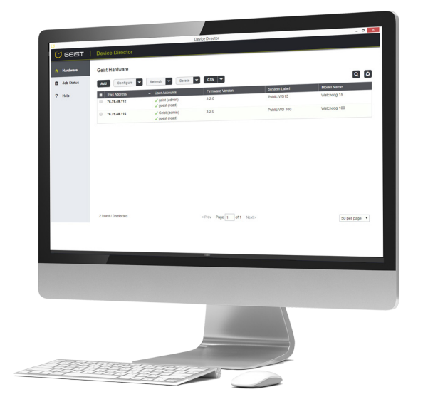
Device Director main view