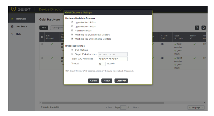
Automatic discovery of Geist devices on the network