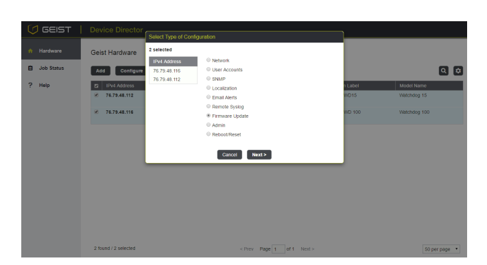
Mass configure settings on user selectable devices

*refer to compatibility chart on the following page to verify firmware requirements