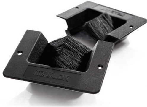
Mini Raised Floor Grommet Part No. 10077